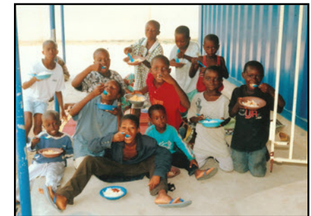
January 2010 Enjoying a meal on the porch

Glossary Praise Valley Foundation UK (PVF UK) We are a registered charity working to relieve sickness, hardship and distress in accordance with Christian principles, advancing the Christian Faith and providing or assisting in the provision of education.