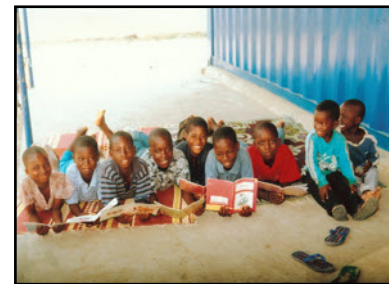
January 2010 Library users read in the shade