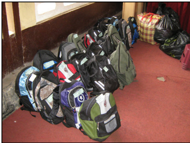
These backpacks contain school uniform, shoes, stationary, dictionary and sundry items for Share Foundation scholarship students.